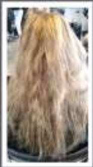
Keratin treatment before