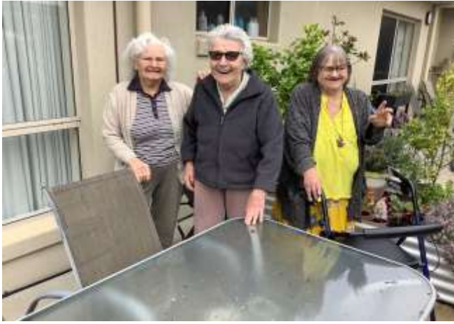
Residents of Estia Health, Long Gully enjoying the garden