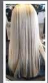
Keratin treatment after

To make an appointment or enquire on services or prices please phone or drop into the salon.