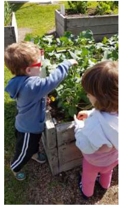
Great to see children enjoying the tastes, smells and touch of the garden!